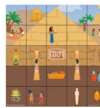
Loti-Bot Ancient Egypt Mat