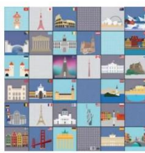
Loti-Bot Mat - Cities around the World