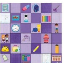
Loti-Bot Mat - School