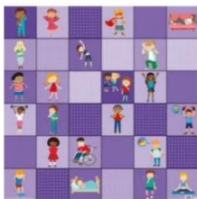
Loti-Bot Mat - Feelings and Emotions

Bee-Bot is also compatible with the newly designed Loti-Bot mats, allowing further exploration of a range of topics.