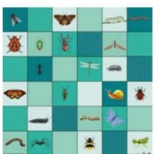
Loti-Bot Mat - Minibeasts