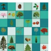
Loti-Bot Mat - Trees