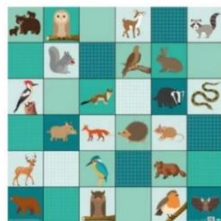
Loti-Bot Mat - Woodland Animals