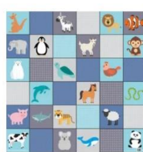
Loti-Bot Mat - Animals