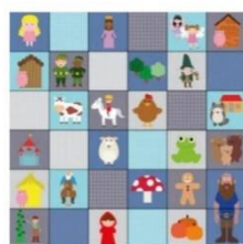
Robotic Mat Fairytale