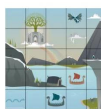
Robotic Mat Viking